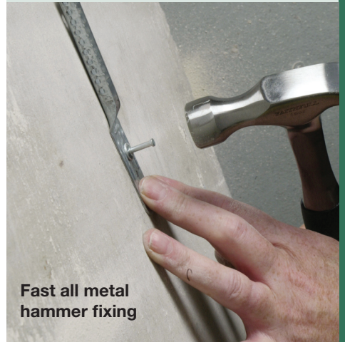
Fast all metal hammer fixing

Pre-assembled all metal hammer set through fixing.